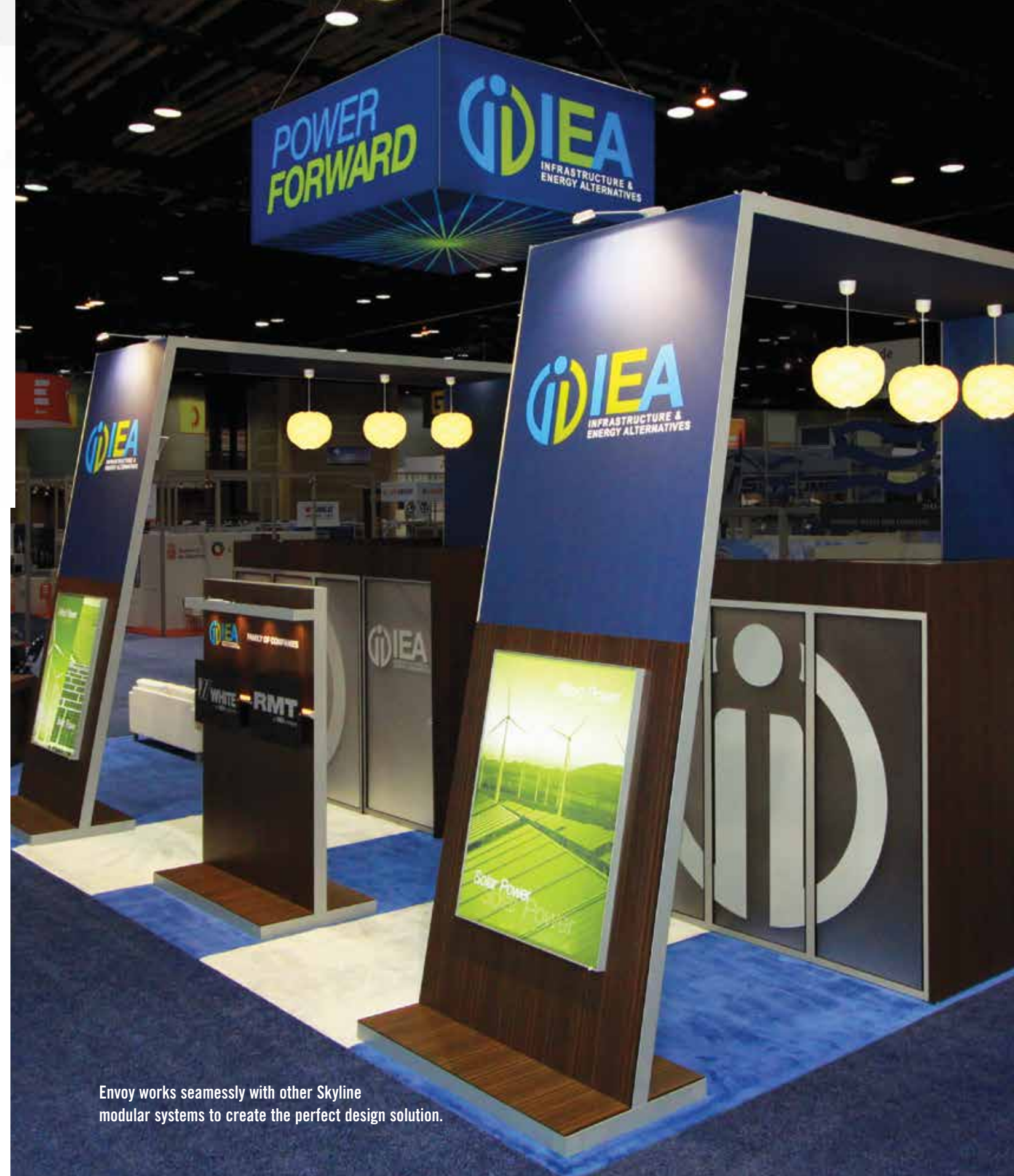
Envoy works seamlessly with other Skyline modular systems to create the perfect design solution.

Custom modular Envoy has cross-compatible straight, curved and angled components and connections to create the look that's right for your brand. Ceilings help define space and create a warmer environment for attendees.