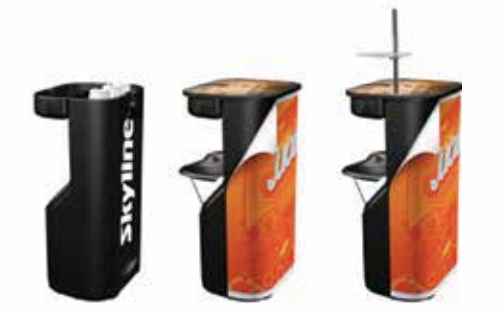
Quick, Easy Installation In just a few steps, Arrive goes from case to stylish workstation.

Arrive with everything you need. Arrive<sup>®</sup> quickly transforms from a single banner stand case into a complete 10' (3 m) display and functional workstation tailored to fit your brand and show objectives.