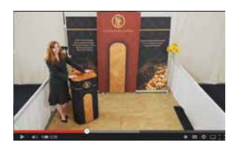
See How Easy Exhibiting Can Be Arrive gives you so much in so little time. You'll be ready to exhibit in minutes. skyline.com/product-videos/arrive