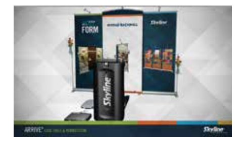
See the Magic of Arrive! See the all features of the smartly-designed Arrive system. skyline.com/product-videos/arrive