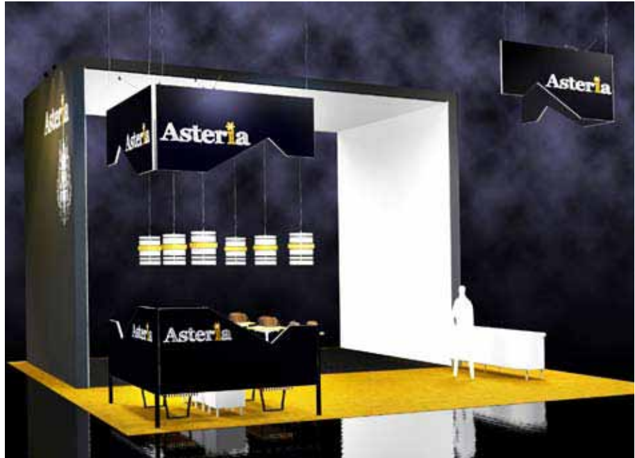
Custom shapes, and the use of positive and negative space, can create interesting areas without adding significant bulk and weight. PictureScape works with SkyTruss® structures (above) and other Skyline custom modular systems.

Exhibit infrequently? Rent your exhibit hardware now and leave future design possibilities open. Or rent additional components for a larger presence at your major show.