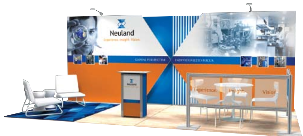
Exhibit shape and graphics come together! The three units to the right create a layered look and a powerful, cohesive brand presentation.

Make a statement with bold shapes that make an impression and say more about your brand.